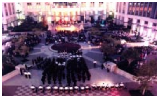
(aerial view of newly dedicated Orlando Memorial)