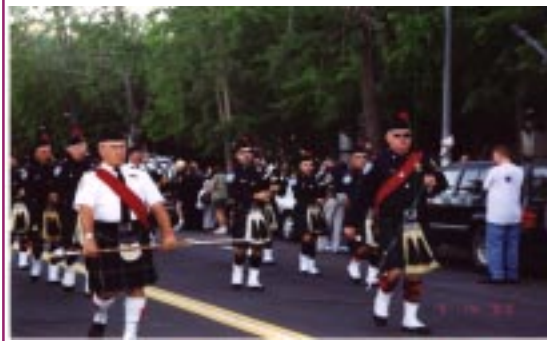
Police Pipe & Drum Corp of Florida on Parade in Washington, DC at the National Police Officer Memorial