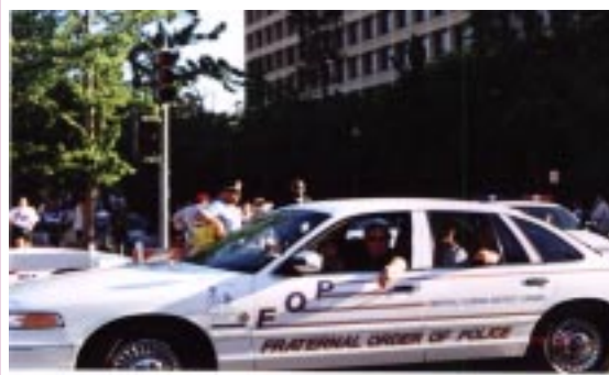
District 7 vehicle in Mass Pipe Bands Parade in Washington, DC at the National Police Officer Memorial