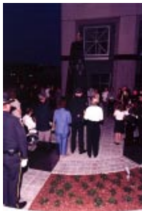
(newly dedicated Orlando Memorial)