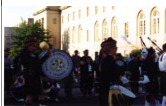
Police Pipe & Drum Corp of Florida on Parade in Washington, DC at the National Police Officer Memorial