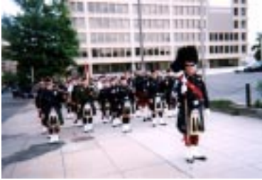
The band on the march in D.C. on the way to National Police Memorial site