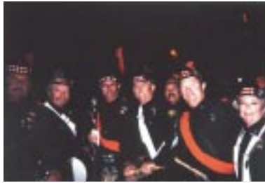
John Ratzenberger (Cliff Clavin of Cheers) with the band at the end of the parade in Washington D.C.