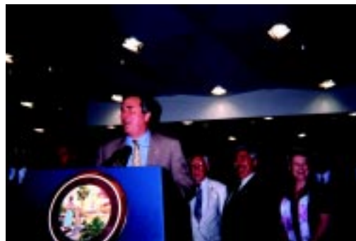
Governor Bush addressing the news media at the formal signing of the Public Safety Heart Bill

By the time you receive this newsletter, we will have a signed Heart Bill and will have attended the National Memorial in Washington. D.C.