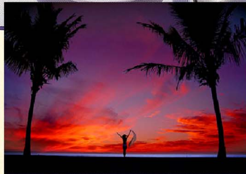
ST. PETE BEACH, FLORIDA

DISTRICT THREE LODGES Hosts 57th Annual Florida State Conference June 20 to 24, 2006